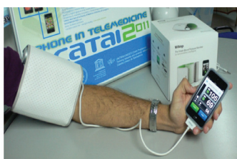
Figure 4. A. iPhone BP- Withings system; B. iHealth blood pressure cuff

A survey was carried out among the 20 students participating in the winter course of the CATAI 2011. They evaluated in the workshop area two iPhone NIBP systems (Withings and iHealth-BP3) on six aspects: Global evaluation,