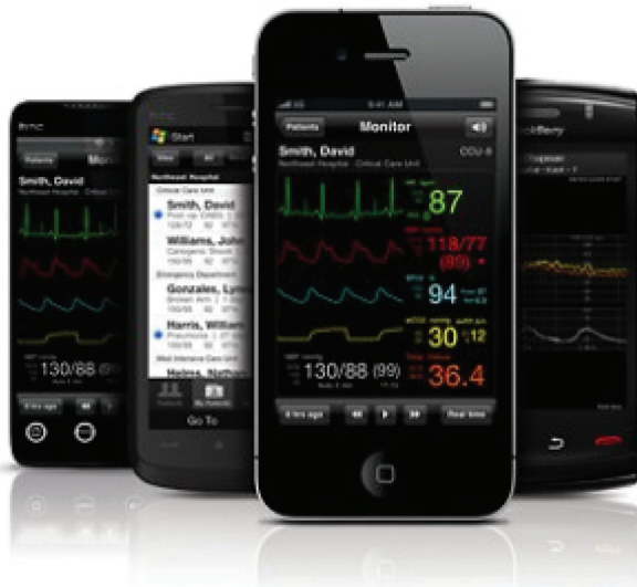
Figure 2. AirStrip vital sign control on iPhones ( http://www.airstriptechnology.com/ )