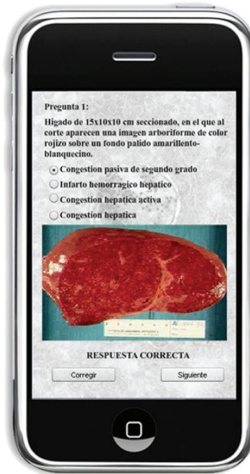
Figure 10. iAnapat from the CATAI®

with their plug & play Careware-iBus mentioned in the introduction, the first MD-bus or iBus on the market to our knowledge, facilitating