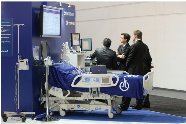
Figure 11. Smart-Room from CERNER ( http://www.cerner.com/ )

the SmartRoom a plug and play hospital room (Figure 11) ( https://store.cerner.com/hospi-