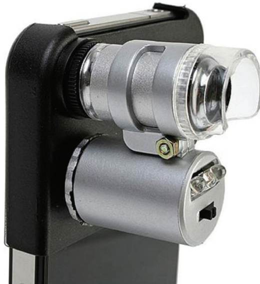
Figure 7. iPhone adapter 60xwith a LED illumination ( http://www.mobile.brande.com )

acid (VIA) for distant consultation ( http://catai.net/blog/2010/07/smartphone-y-screening-cancer-cervix/ ).