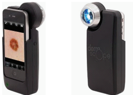
Figure 8. DermScope, cost 10 $

It consists of a stainless alloy sensor monitors neural signals, inputting them into our ThinkGear ASIC chip, which processes the signal (Figure 9). Noise coming from ambient environment, muscle movement, chewing, etc. are digitally filtered out and eliminated. Raw brain signals are amplified and processed by algorithms—delivering concise input to the device with which the user is interfacing. Algorithms come from both NeuroSky as well as