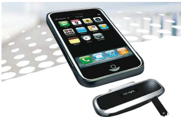
Figure 3. iPhone with the iBGStar device ( http://ibgstar.com/web/ibgstar )

cdrh_docs/pdf10/K102939.pdf). They are using an approved non-invasive blood pressure (NIBP) device like the SunTech module. Technical specifications include: 0-295 mmHg with \pm 3 mmHg accuracy; Pulse rate 40-180beats/min, accuracy: \pm 5\% . Oscillometric method. IEO 60601-1, Medical Electrical Equipment - Part 1: General Requirements for Safety, 1988; Amendment 1, 1991-11, Amendment 2, 1995. * UL 60601-1, Medical Electrical Equipment - Part 1: General Requirements for Safety, 2003. * IEC 60601-1-1, Medical Electrical Equipment - Part 1: General Requirements for Safety - 1. Collateral standard: Safety Requirements for Medical Electrical Systems, 2000. * EN 60601-1-2, Medical Electrical Equip-