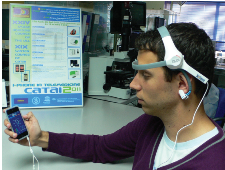
Figure 9. NeuroSky e-sense dry sensor with Xwave